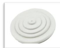
PG 36 Seal