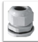
PG 21 Seal